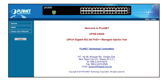
Figure 3-3: Web Main Screen of 802.3bt PoE++ Managed Injector Hub

The following web screen is based on the UPOE-2400G. The displays of the UPOE-800G and UPOE-1600G are the same as that of the UPOE-2400G.