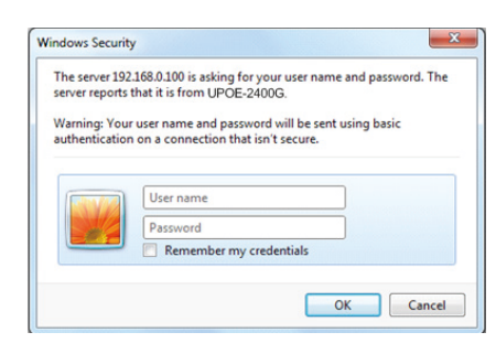
Figure 3-2: Web Login Screen

3. After entering the password, the main screen appears as Figure 3-3 shows.