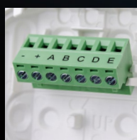
Adjustable terminal block