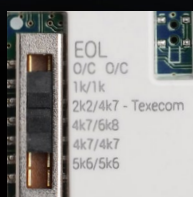
Built in EOL resistors