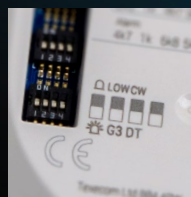
Selectable CloakWise & Dual Tech modes