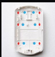
Flexible mounting points