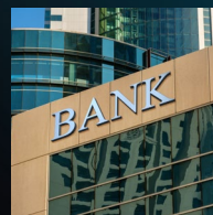
Banking & Finance

Capture motion detectors excel in a wide variety of professional security applications.