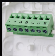
Adjustable terminal block