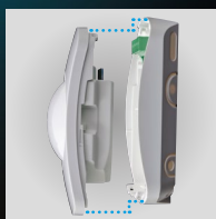
Front-loaded fully sealed electronics