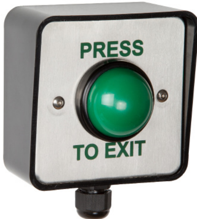
Weatherproof Exit Button