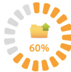
Wireless N Performance

The W311MI uses Wireless N 150 technology to provide increased speed and range than the previous 802.11g standard, giving you a faster, more reliable connection, making it ideal for email, web browsing and file sharing in the home.