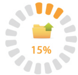
Wireless G Performance