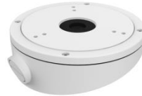
Inclined Ceiling Mount